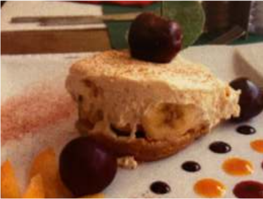
HOMEMADE BANOFFEE PIE £6.95