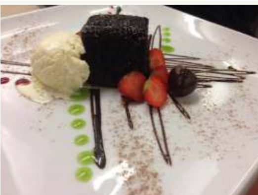
HOMEMADE CHOCOLATE BROWNIE £7.50 Served with vanilla ice cream