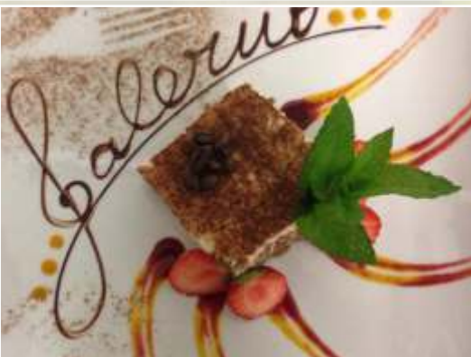
HOMEMADE TIRAMISU £6.95