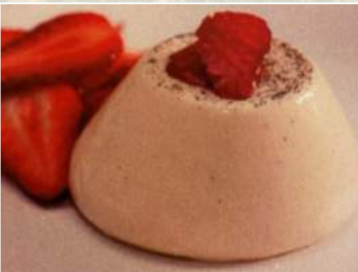
HOMEMADE PANNACOTTA £6.50 Vanilla flavour