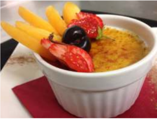
HOMEMADE CREME BRULEE £6.95